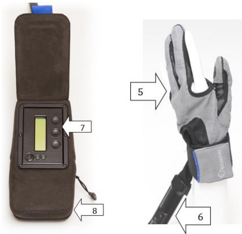
FIGURE 2. CONTROL UNIT AND GLOVE CLOSE-UP